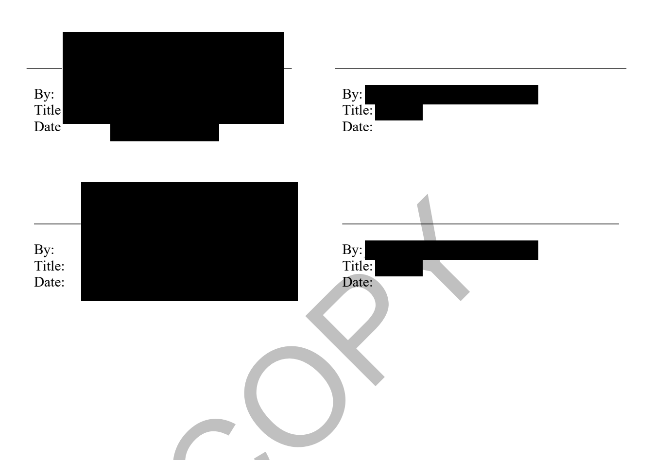
PMF 2024-2 PLC